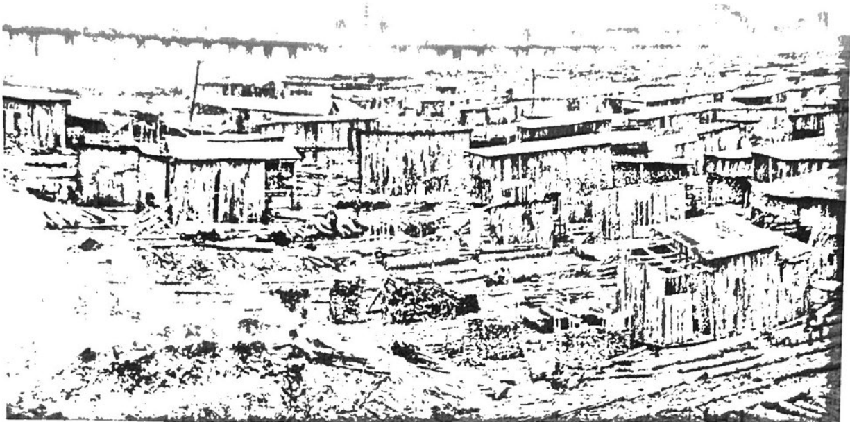
Makoko, a slum located in a lagoon in Lagos, Nigeria.