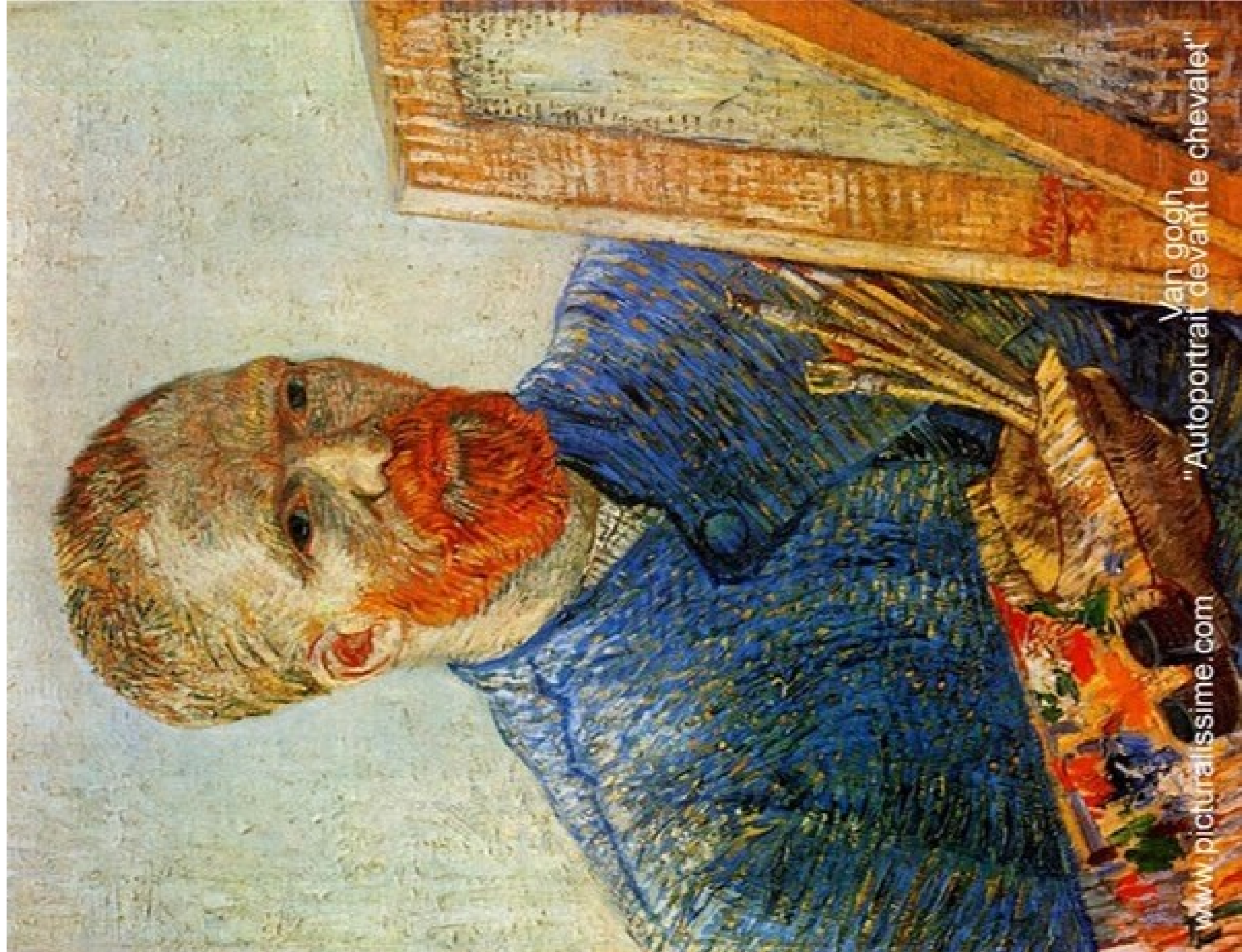
Van gogh "Autoportrait devant le chevalet"