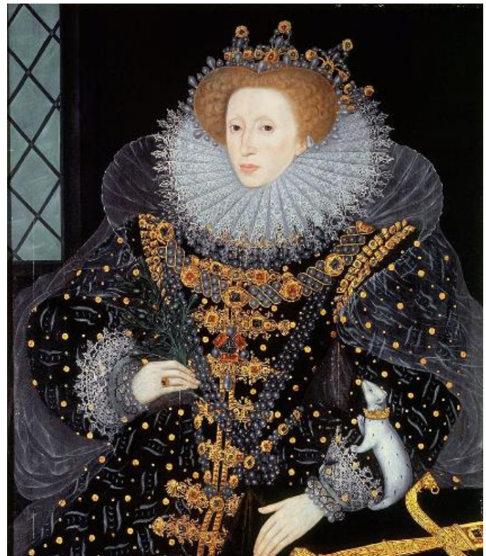
Queen Elizabeth 1 st , the "Ermine Portrait", Segar William, 1585.