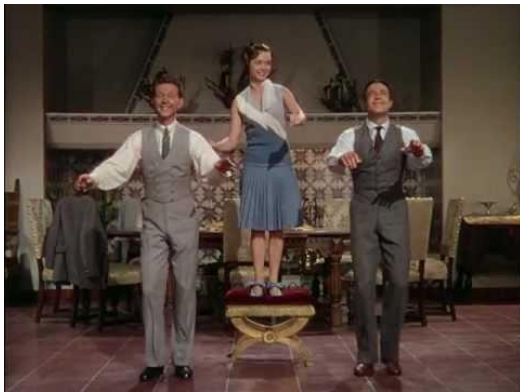
CLUE NUMBER 1

What other differences can you see ? Look at the titles.