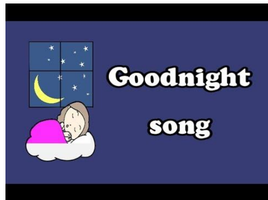
CLUE NUMBER 2

Now, watch this video and play this game .